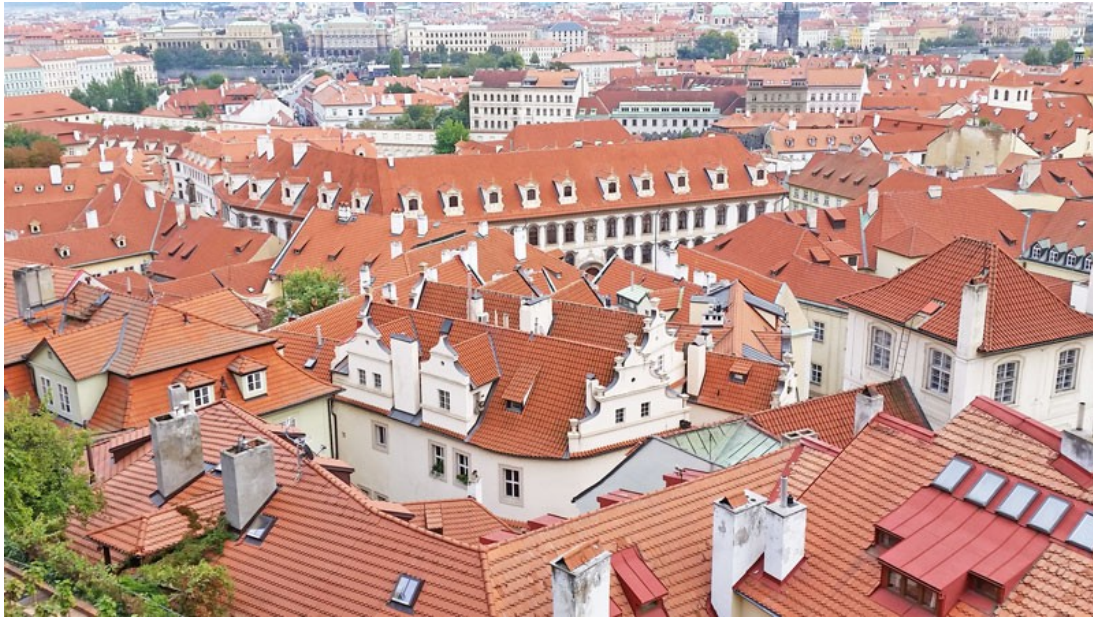
Figure 5: Lesser Town rooftops viewed from the Castle south garden

The Old Town and New Town are on one side of the river whilst the Lesser Town and Castle are on the other side. If you are seeking a quieter place to stay then it should be on this side and the Lesser Town sits conveniently at the bottom of the hill. Again it's a very obviously historic area much of which is just as old as the Old Town. Booking sites will usually call it by its popular English name i.e. the Lesser Town but also look out for the Czech version i.e. Malá Strana.