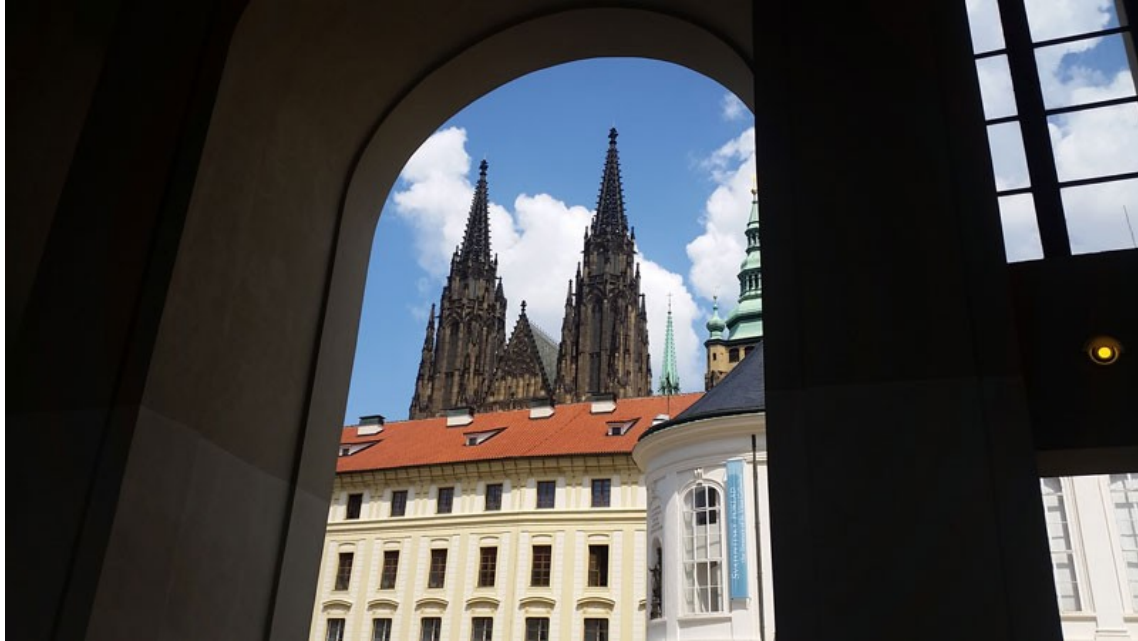
Figure 6: Looking back through the Matthias Gate to ST Vitus Cathedral

The Castle area is by far the quietest of all the Prague 1 towns. After 6pm the Prague Castle historic buildings will have closed and tourist numbers drop like a stone. Only the Castle courtyards will be open until the castle closes at 10pm. With the exception of a couple of restaurants and a brewery it's effectively a dead area after 8pm.