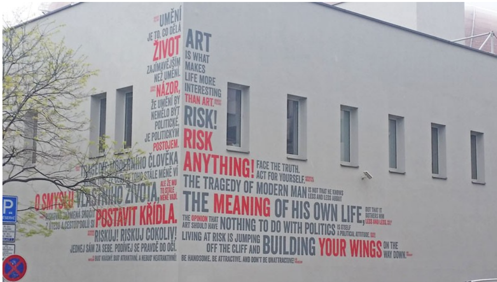
Figure 9: DOX Centre for Contemporary Art

There are two parts to the Prague 7 district. The upper part is called Letná and the lower part is Holešovice. Either are accessible by metro and tram connections so people staying in this area will be travelling mostly by public transport. Culturally there is a separation. While Letná feels a bit more Czech, Holešovice has historically been a place where American expats have settled so this has resulted in a lot of bars and restaurants where you'll hear English just as much as Czech.