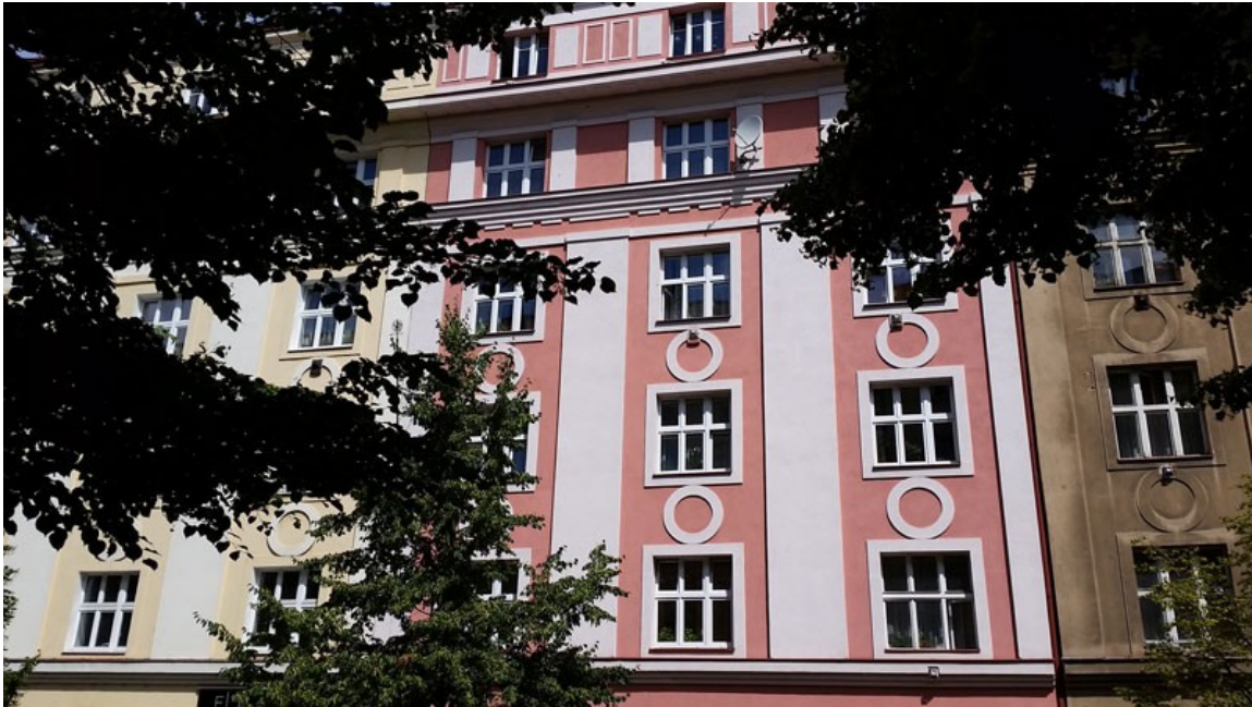
Figure 7: Vinohrady has early 20th Century architecture

A clue to the former use of this land before development is in the name Vinohrady (or Royal Vinohrady). It was a large vineyard and basically the first thing you drove through on your horse and cart having left through the Wenceslas Square New Town gate. The area was developed around the turn of the Century (1890-1910) so it has a very Art Nouveau and Secessionist feel. There are some purpose built hotels but largely it's converted residential buildings.