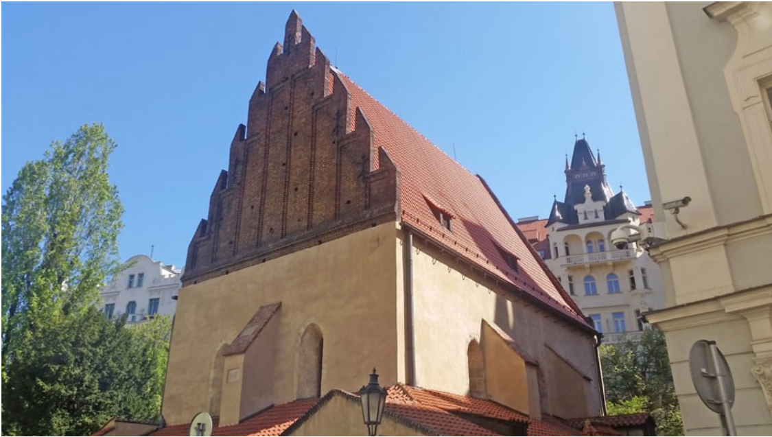
Figure 3: The Old/New Synagogue

The thing here is that Josefov is located entirely within the Old Town but it is designated as the historic area of the Jewish Quarter. Booking comparison sites may list accommodation in this area as being in the Old Town, Josefov or the Jewish Quarter to give themselves a little marketing edge.