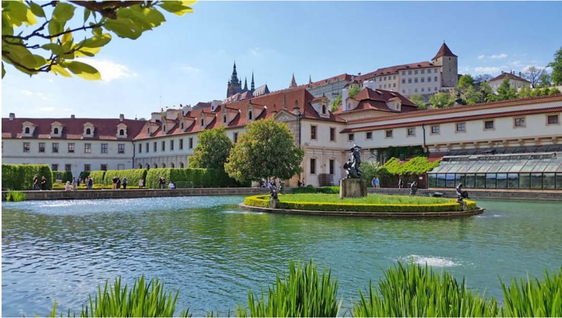
Figure 1- Wallenstein Gardens

There are many great places in the world so there must be a specific reason for wanting to visit. Let's speculate.