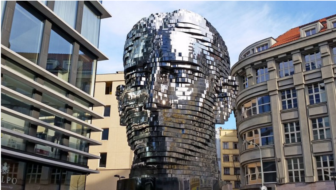
Figure 4: Franz Kafka Head at the rear of the Quadrio shopping centre

The New Town (bit of a strange name when you consider that it became a town in 1412) which makes it older than most city old towns) is still Prague 1 but because of the layout of the city you'll find it drifts into the Prague 2 district almost by accident. It begins at the border of the Old Town on that side of the river. Whenever you stumble across anything about Wenceslas Square or the Republic Square then these are New Town locations that are within a 5 minute walk of the Old Town Square.