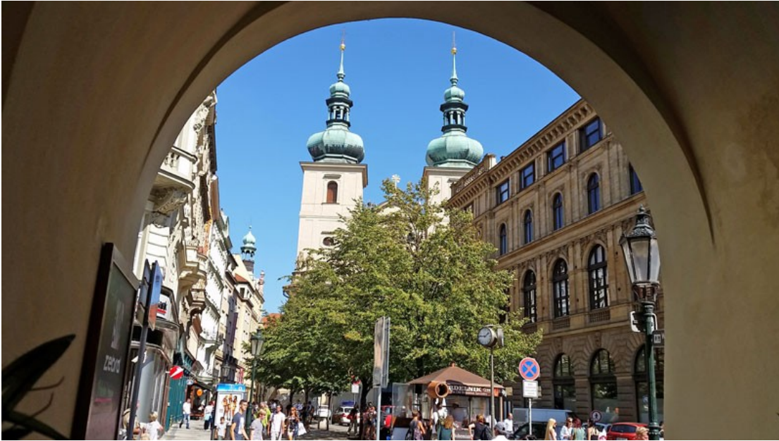
Figure 2 - ST Havels Church viewed from Havelska

Best? That has to be quantified. For some people the best is right in the centre of things. For others it might mean best value or to be closest to a particular venue or attraction.