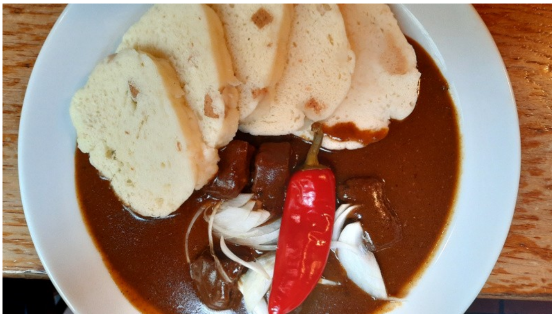
Figure 10: Czech beef goulash with separated pepper

I could have put any number of pictures of Czech food but I decided to go for Goulash. Czechs don't generally like spicy food but there will frequently be a pepper on the plate in case you want more heat.