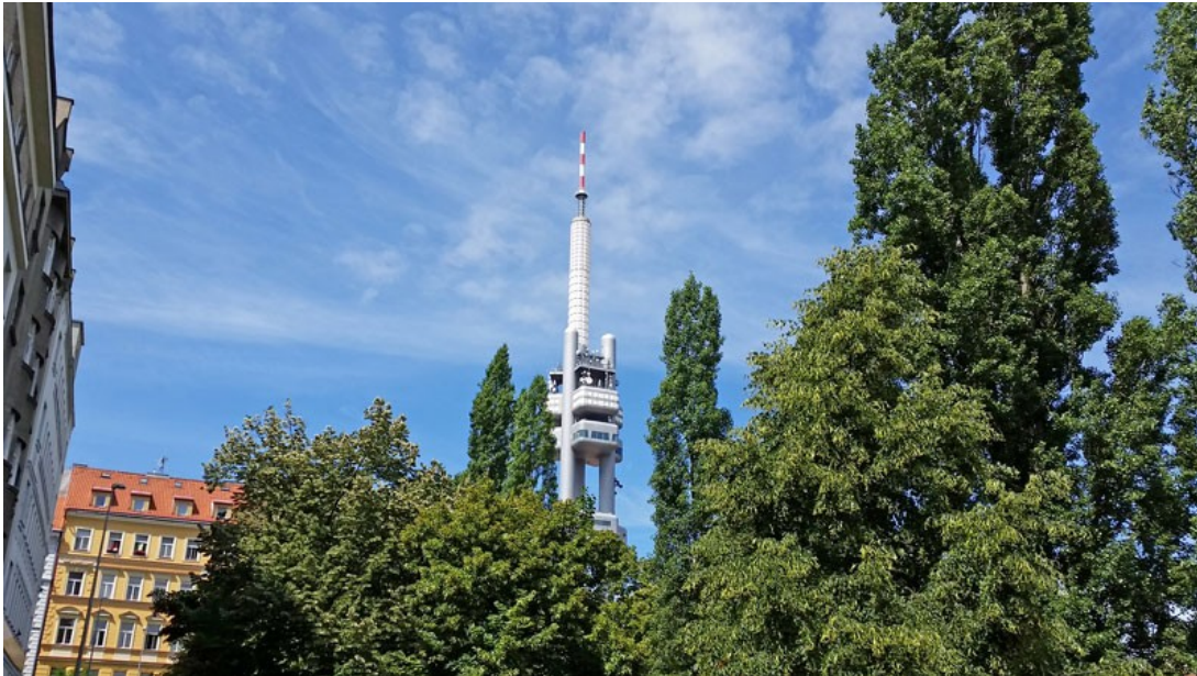
Figure 8: TV Tower, built on an old Jewish Cemetery

Wherever you are in the city if you can see the TV Tower then that's Žižkov. This is the next area over from Vinohrady so unsurprisingly the architecture is similar. Maybe a little newer in places but considered not to be of the same standard as Vinohrady. When somebody refers to the area as "Bohemian" they are saying it's slightly rough around the edges but dig a little deeper and you can find the creative energy of the area. The recreation area at Tower Park with surrounding bars and a short walk to the Riegrovy Sady Beer Garden means it can be lively.