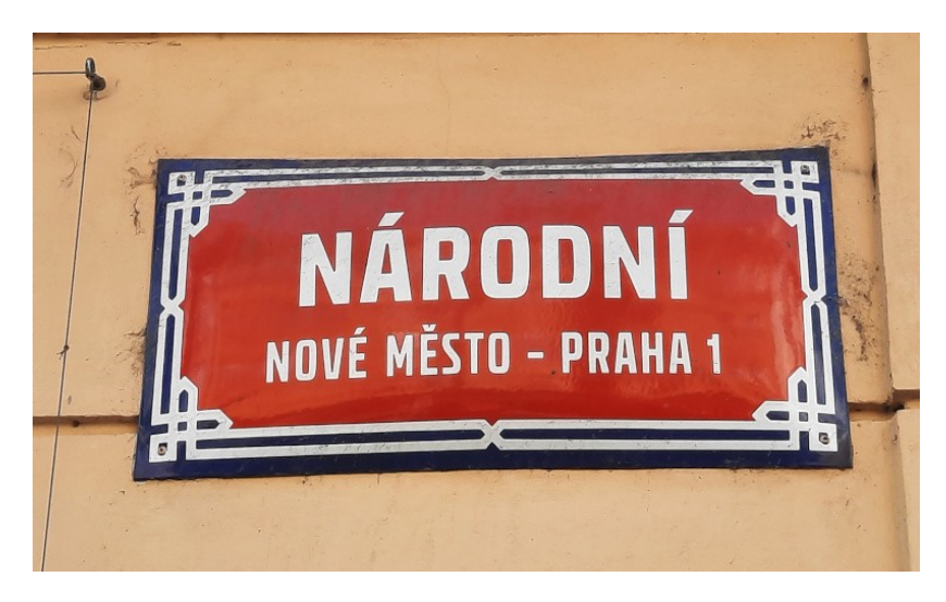
Prague Streets - Národní