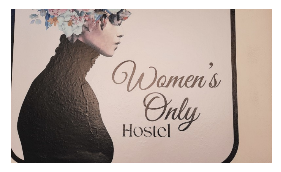
Services - Women's Only Hostel