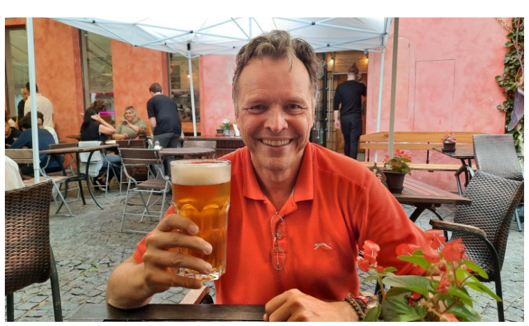
A LUCKY BASTARD (THAT'S THE NAME OF THE BEER)

In the September newsletter we'll take a look at why you might like to visit the Maisel Synagogue, I'll tell you about a new hostel in the city only for women, I'll tell you about the history of "National Street" and I published a video about using Prague Airport Duty Free and other ways of saving money.