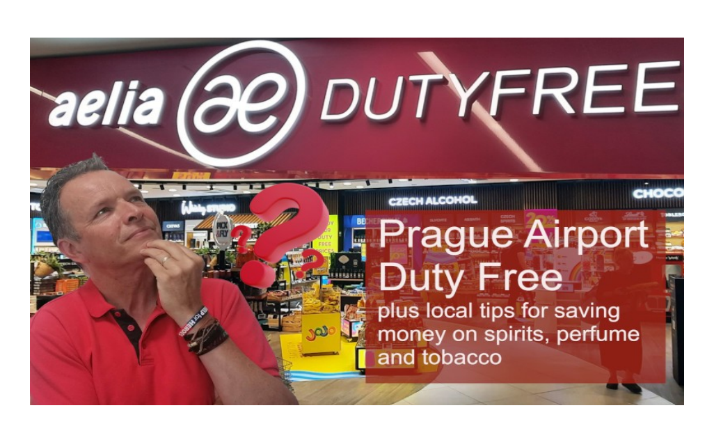
Video – Prague Airport Duty Free