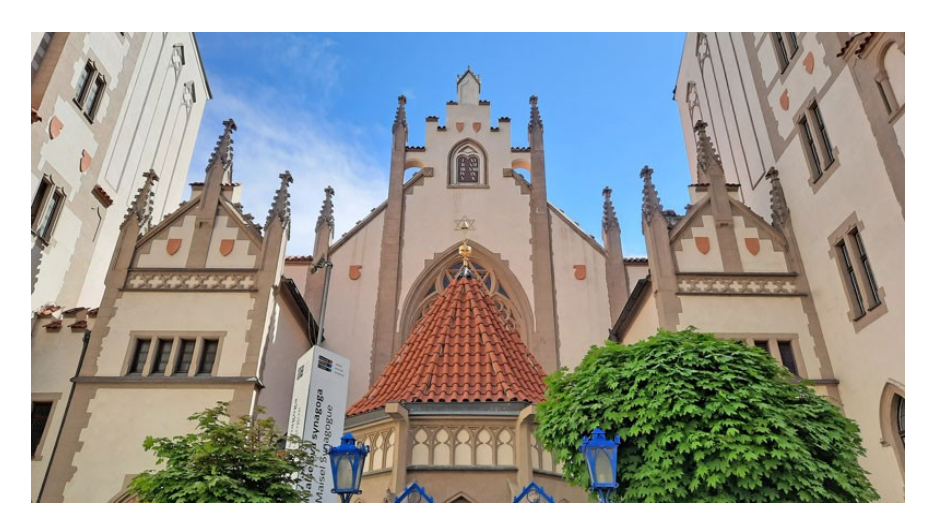
Attractions – Maisel Synagogue