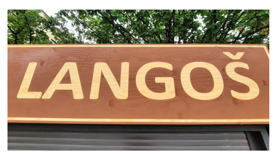
Food and Drink – Langoš