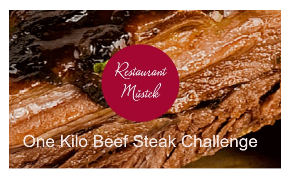
Are you hungry enough or just mad enough?

Czech cuisine is already meat heavy so it should come as no surprise that beef steaks are a common sight on the menu.