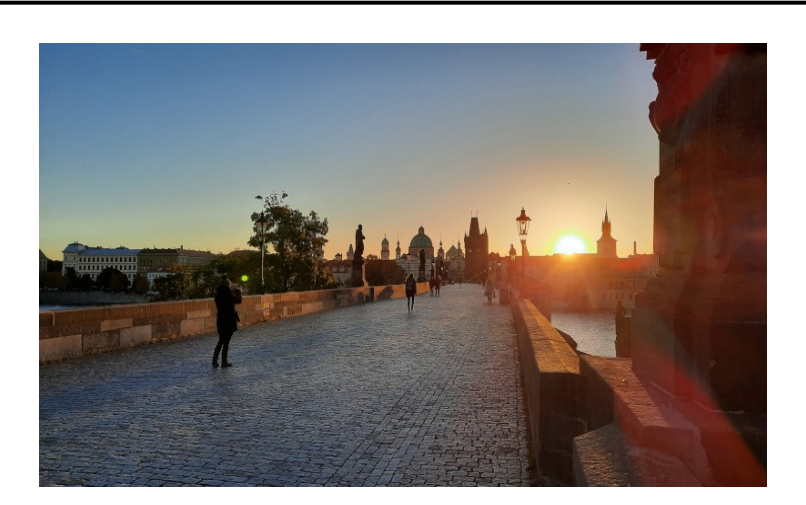
A CHARLES BRIDGE SUNRISE

In the August newsletter we'll take a look at my experience drinking a flight of beer at Fat Cat, we'll take a look at the Czech food snack called Langoš, I did a book review about an inspirational woman from WW2 Prague and I published a video about using Prague's Park and Ride system.