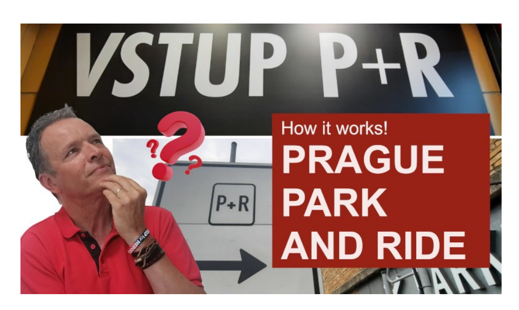
Video - Prague Park and Ride