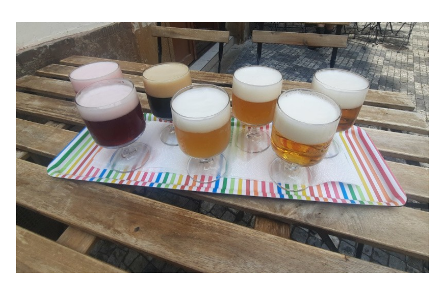
Food and Drink - Flight of Beer