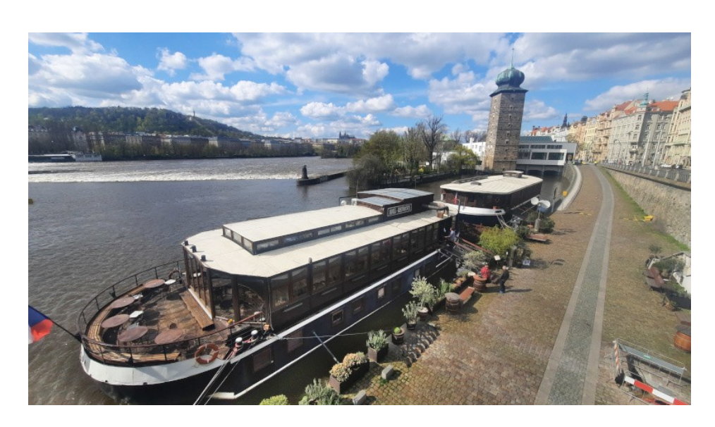
Boat Hotel Matylda and Klotylda