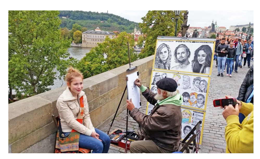
Activity and Souvenir all at the same time

All over the world you'll find immensely talented artists plying their trade at tourism hot spots and Prague is no exception.