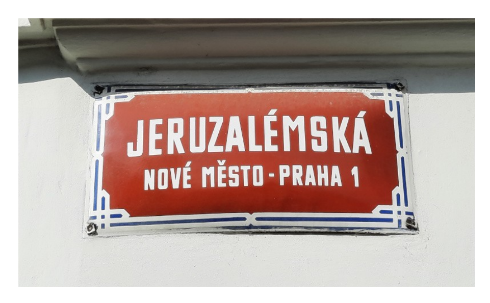
Prague Streets - Jeruzalemska