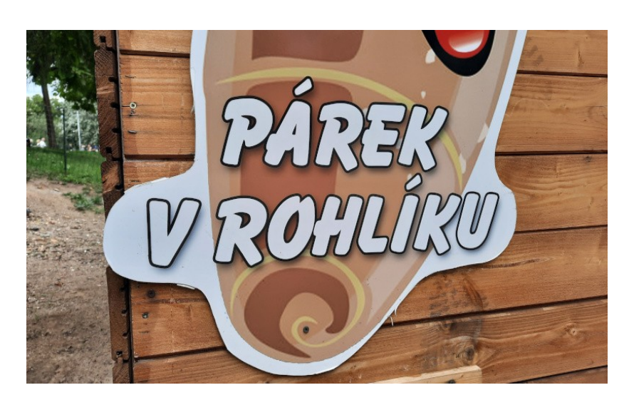
Párek – Czech Standard Hot Dog