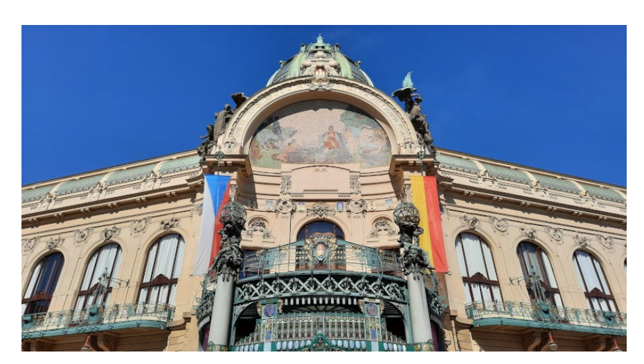
The Municipal House