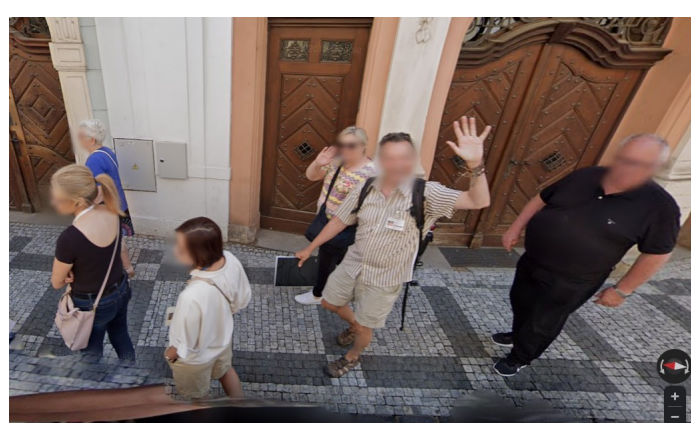
WHEN YOU SEARCH GOOGLE MAPS FOR MAISELOVA 18

In the April newsletter I'll tell you a few things about the Art Nouveau Municipal House, I'll tell you about what to expect from the standard Czech Hot Dog called Párek, we'll take a look at how the street called Jeruzalemska got it's name and I did a book review of something called "Out of the Midst of the Fire".