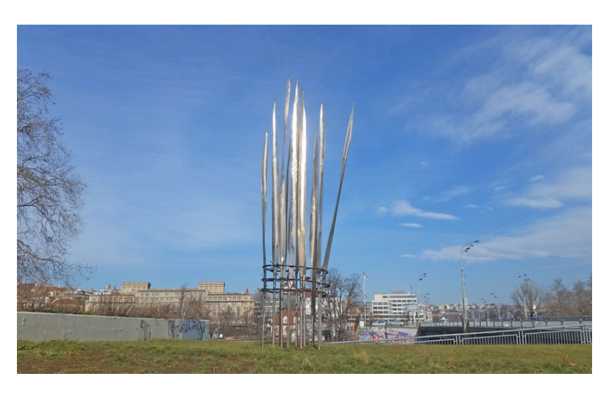
Memorials – Victims of Collectivisation