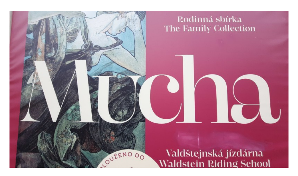
Famous Czechs - Alfons Mucha