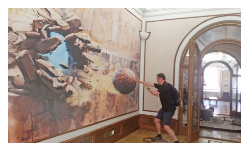
Illusion Art Museum in Melantrichova

February is statistically the coldest month of the year so you'll be looking to do a lot of things inside. Museums are an option and the Illusion Art Museum is a lot of fun. You may find published guides still show this on the Old Town Square but they have now moved 300 metres away to Melantrichova.