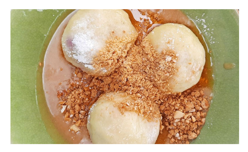
Czech Food – Plum Dumplings