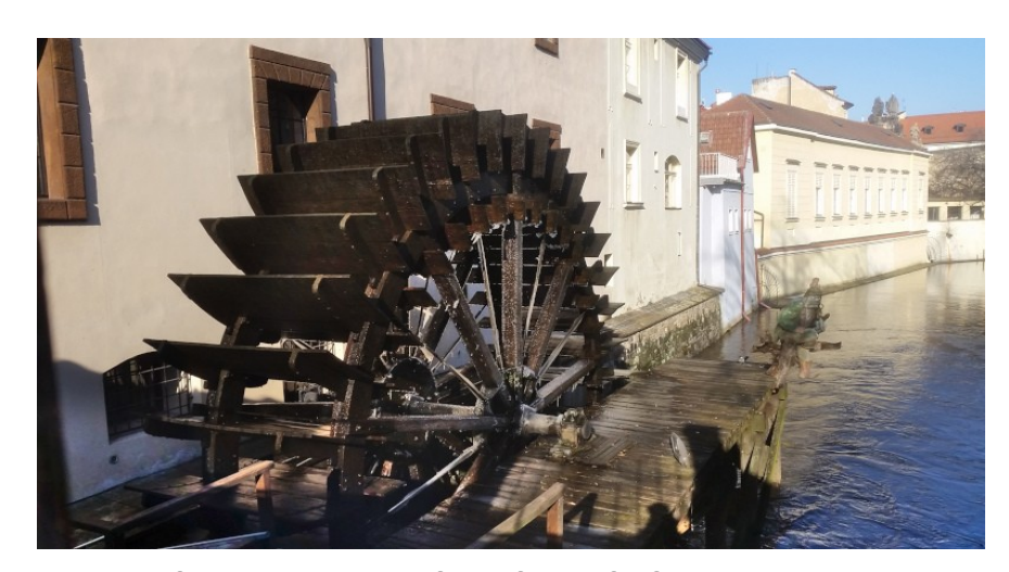
The Water Wheel and the Demon