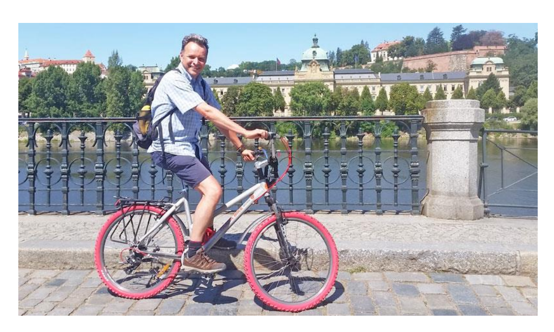
Hiring a bike in Prague and Planning a Route

April has arrived. It's time to be thinking about getting out and stretching those legs so what better than a bike trip.