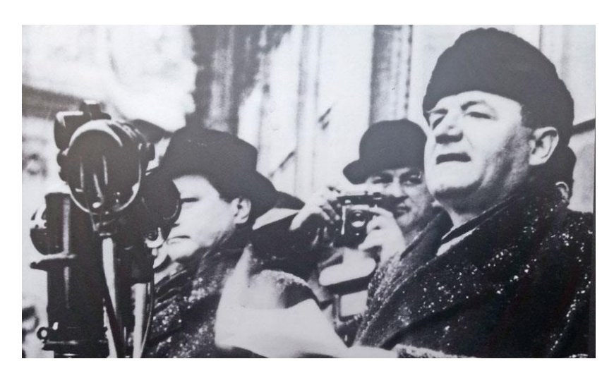
1948 Communist Coup