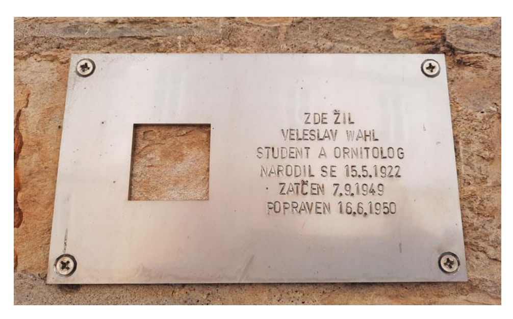
The Last Address