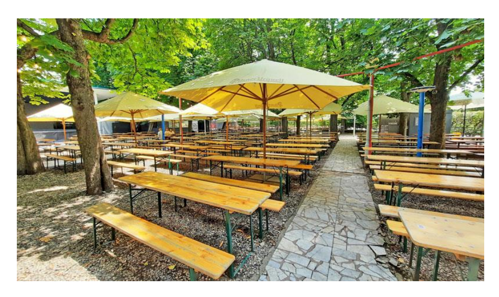
Riegrovy Sady Beer Garden and Park

Riegrovy Sady is a park above the main train station that covers an area of about 11 hectares and that's just a part of what it used to be. It's got quite a history going back to when it was vineyards in the time of King Charles IV and later became a series of formal gardens.