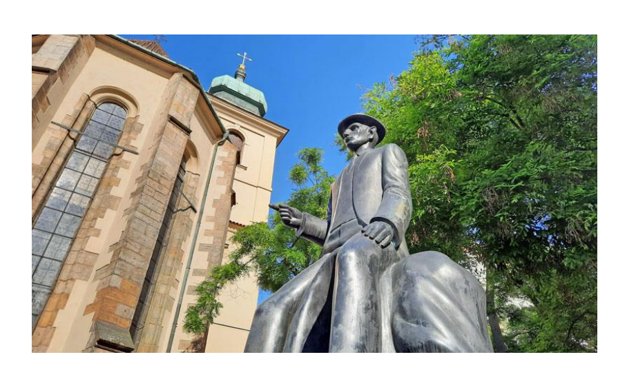
Franz Kafka Monument