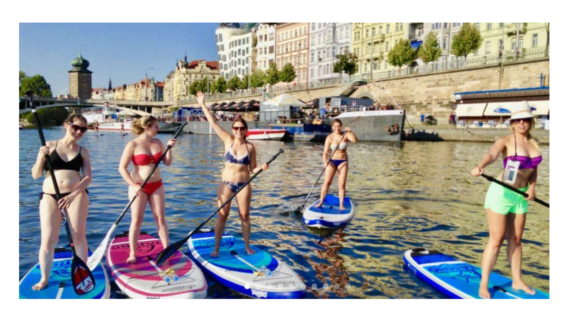
Standing, kneeling or sitting down, still fun

If you want to mess about on the river for a couple of hours but you don't want to hire a boat then maybe paddleboarding will be an option for you.