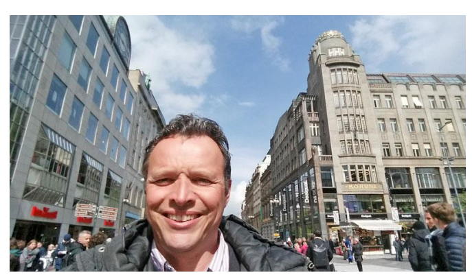
PRE-PANDEMIC ON WENCESLAS SQUARE

For the February Newsletter as well as the most recent Coronavirus status, for the Brits I've included what to expect from the new GHIC (Global Health Insurance Card). For my featured content I've included places to eat Halal food, an introduction to Jan Hus, Pinkas Synagogue and a curious World War Two story. For water sports fans we'll also look at a Prague Paddleboarding option.