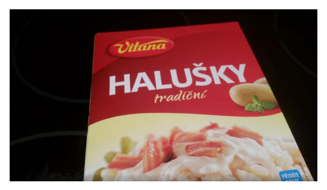
Czech Food - Halušky