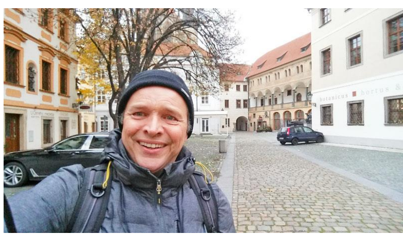
11AM TUESDAY NOVEMBER 24TH AND NOBODY IN THE TYN COURTYARD

For the December Newsletter as well as the most recent Coronavirus status I've included seasonal content including what to expect from the scaled down Prague Christmas Markets, where to participate in some glass blowing, understand what options you'll find for eating Halušky, learn where there's a hidden time capsule in the city, view a copy of a VERY historic building and there's a book review for people who want a reason to explore.