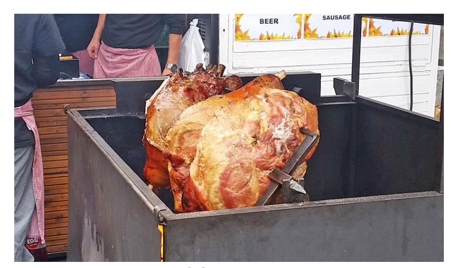
Old Prague Ham