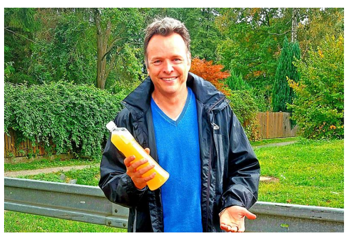
A LITRE OF EARLY WINE IN OCTOBER

For the November Newsletter as well as the most recent Coronavirus status I've included some tips for eating the popular Old Prague Ham. There's some history and why you should visit the Jubilee Synagogue. I'll explain what you're looking at when you have the Calendarium in view. There's a look at the WW2 bombings in Prague and specifically one of them. Finally we'll explore one of the creative things to do in Prague.